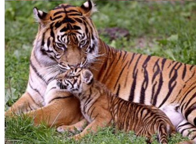
Tigress with a cub